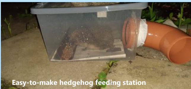
Easy-to-make hedgehog feeding station