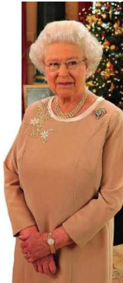
Queen Elizabeth II 1926—2022

We can surely be grateful that, two thousand years after the birth of Jesus, so many of us are able to draw inspiration from his life and message, and to find in him a source of strength and courage.