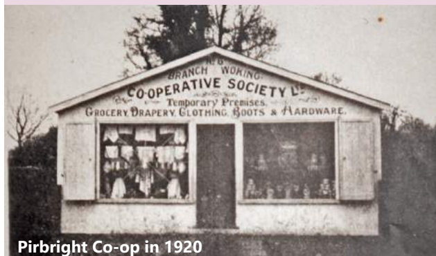
Pirbright Co-op in 1920